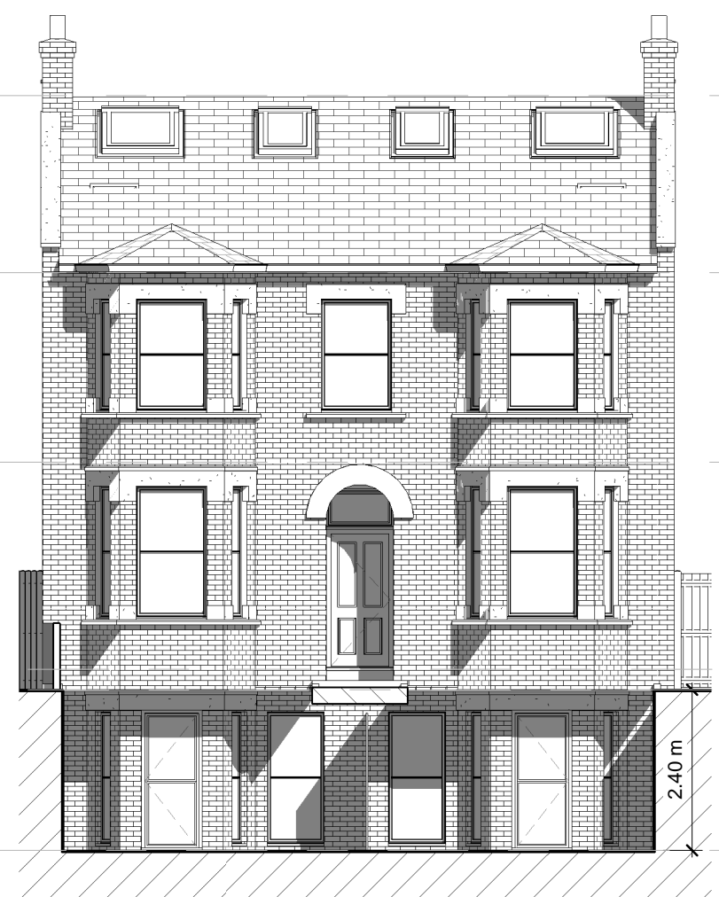
Proposed Front Elevation. 1 : 100