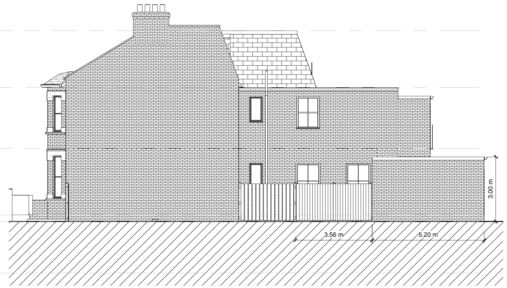
Proposed Side Elevation. 1 : 100